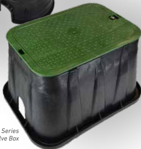
NDS Pro-Spec Series 14"x17" Corrugated Valve Box