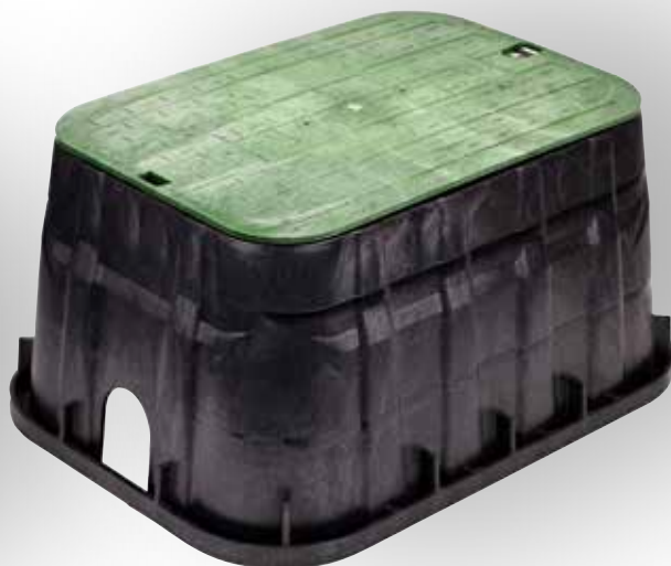
NDS Pro-Spec Series 15"x 21" Corrugated Valve Box