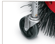
TURF CASTER Part # 135-2311