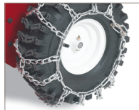
TIRE CHAIN KIT Part #107-3813