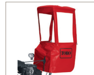
SNOW CAB KIT Part #116-8227