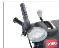
LIGHT KIT Part #116-8234