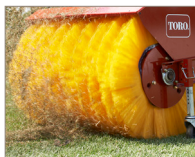
TURF BRISTLE DISCS Part #116-8233