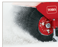
CONCRETE/SNOW BRISTLE DISCS Part #116-8232