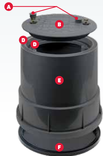
TVB-12RND-DB (Round Dry Box)