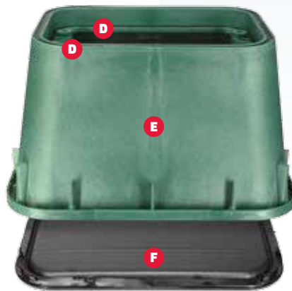
TVB-1217-DB (Dry Box)