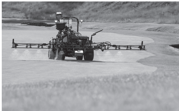
GeoLink Spray individual nozzle control saves time and money.

RTK: Real Time Kinematic (RTK) satellite correction is a technique used to enhance the precision of position data derived from satellite-based positioning systems, being usable in conjunction with all positioning platforms.