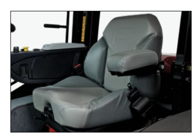
Air-Ride Suspension Seat

• Includes headlights and front & rear flashers – available for cab and non-cab models