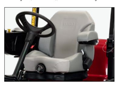
Mechanical Suspension Seat

Measures slope – includes visual indicator