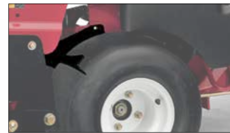
WHEEL SCRAPER KIT

Effectively prevents sand, soil and other debris from accumulating on the rear tires.