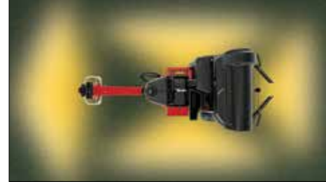
LED LIGHT KIT

In addition to the new and exclusive LED light kit for the ProCore 648s, all current accessories for the previous generation ProCore 648 are fully compatible with ProCore 648s.