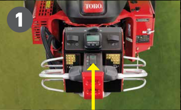
1 Set selector switch to Delayed Mode