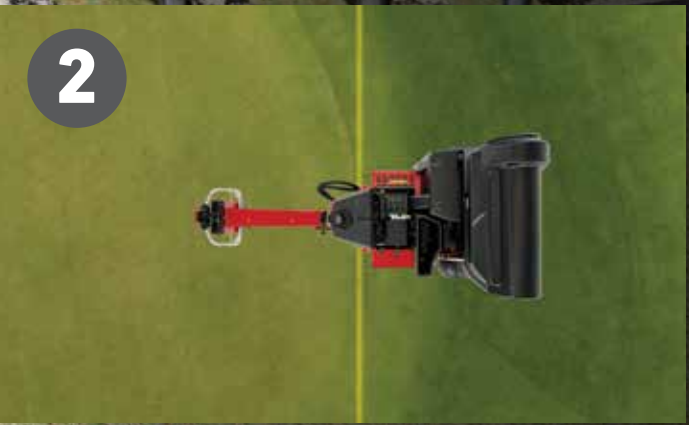
2 Use front tire as indicator of where to engage aeration