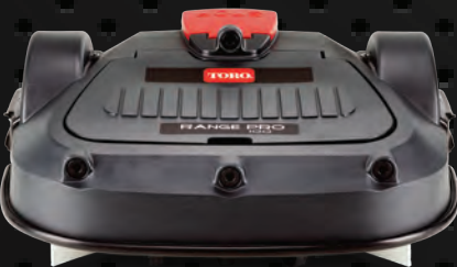
Range Pro 100