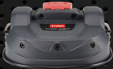
Turf Pro 300