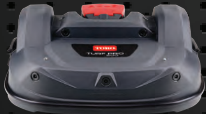
Turf Pro 500