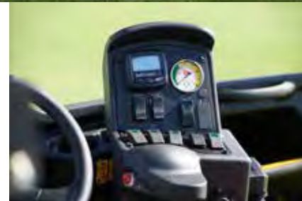
Quick Find Console®

The Toro Multi Pro WM is ready to perform when you need it most. Invite your Toro Distributor to demonstrate how this sprayer can enhance your spraying program.