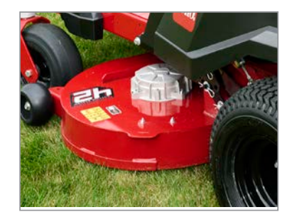
IRONFORGED® FABRICATED DECK The heavy duty steel IronForged Deck doesn't flinch no matter what you throw its way.