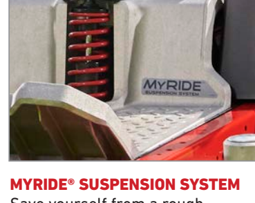
MYRIDE® SUSPENSION SYSTEM Save yourself from a rough terrain-driven beating with our patented MyRIDE Suspension System. (Model 75851)