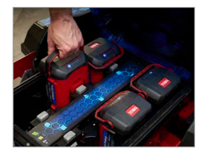
BATTERY POWERED Powered by 4-6 removable 60V Max* Flex-Force batteries