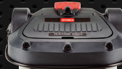
Range Pro™ 100