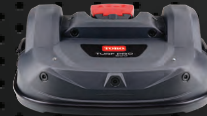
Turf Pro® 500