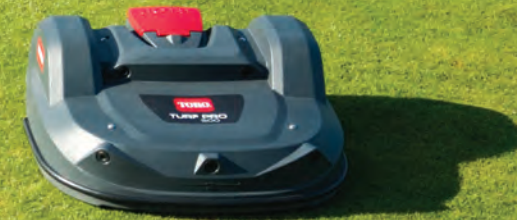
Turf Pro® 300