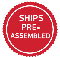
SentrySand Flex Trailer 4 x 48" Tank Sand Media System Equivalent

SentrySand Flex Stationary 4 x 48" Tank Sand Media System Equivalent Equivalent Flow Range: 790 - 1320 GPM Backflush Flow Rate: 190 GPM Pressure: 87 psi Maximum