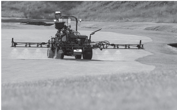
GeoLink Spray individual nozzle control saves time and money.

RTK: Real Time Kinematic (RTK) satellite correction is a technique used to enhance the precision of position data derived from satellite-based positioning systems, being usable in conjunction with all positioning platforms.